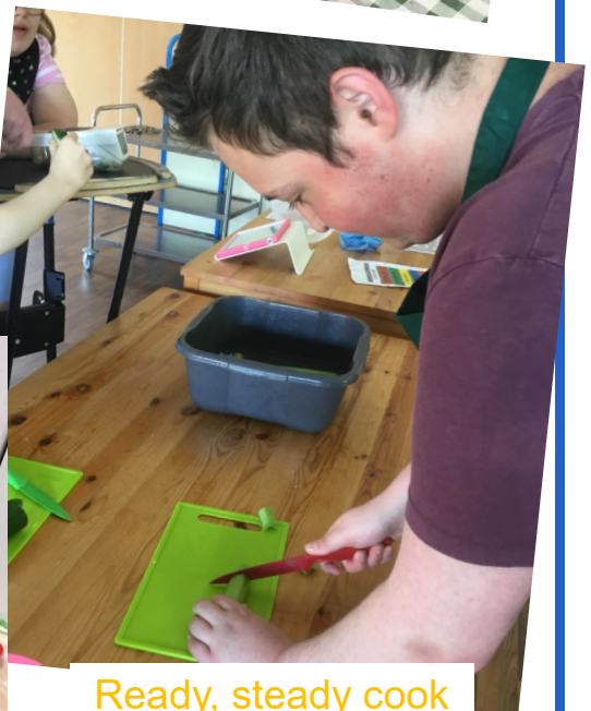
Ready, steady cook