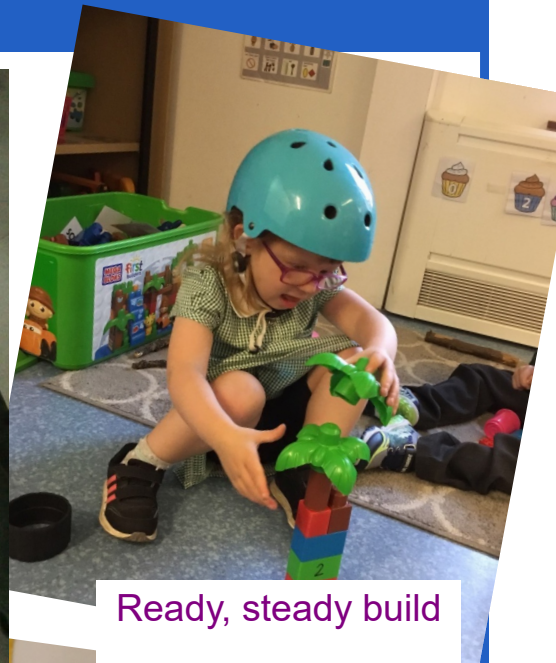
Ready, steady build