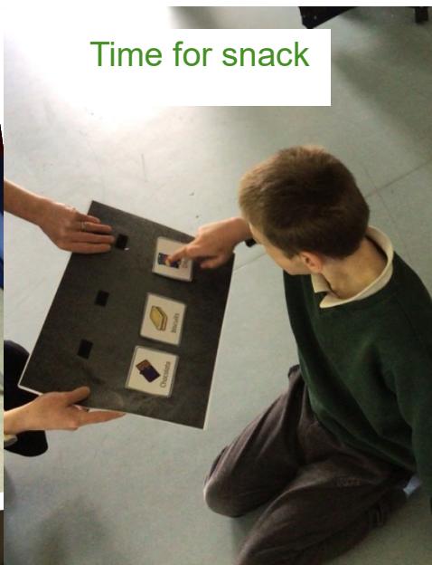
Time for snack